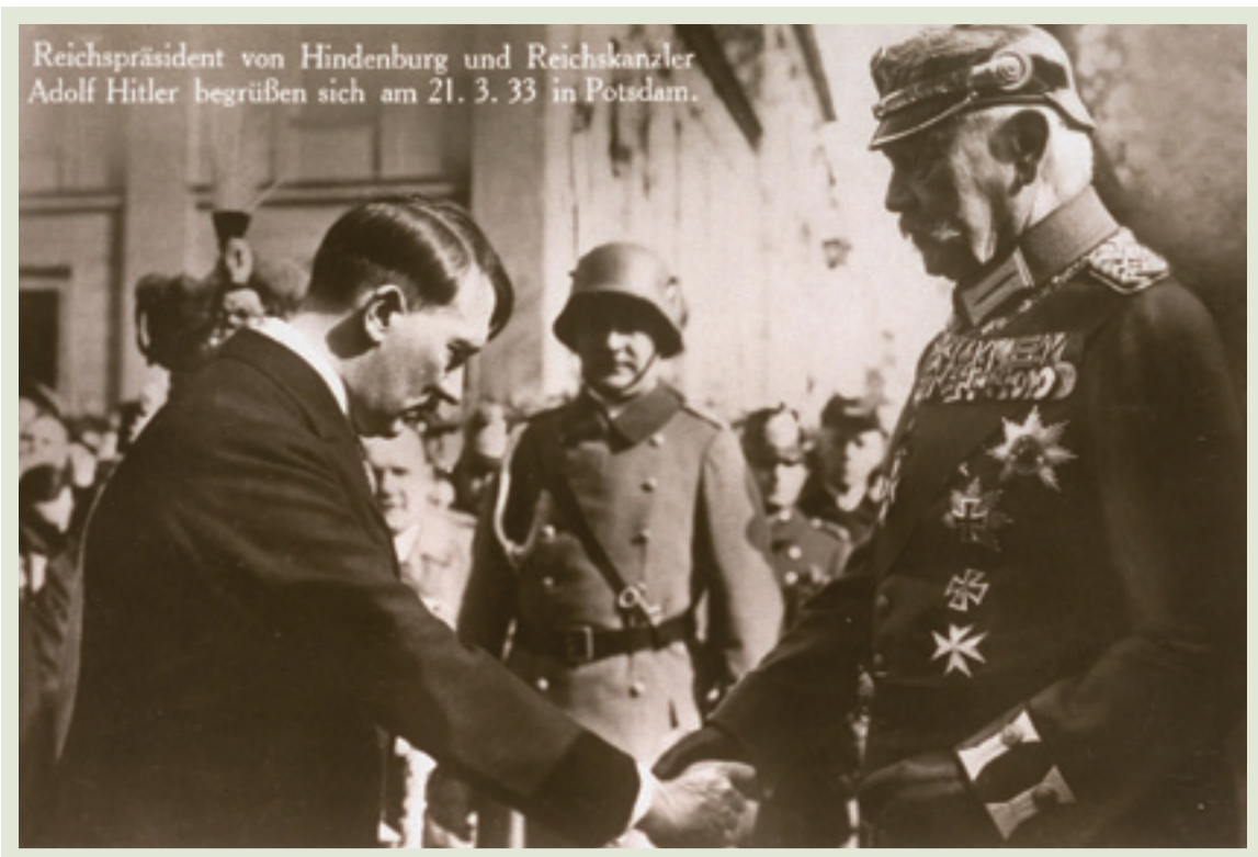
President Paul von Hindenburg greets Chancellor Adolf Hitler during state ceremonies. Potsdam, Germany, 1933.

Popularly known as the Reichstag Fire Decree, the regulations suspended important provisions of the German constitution, especially those safeguarding individual rights and due process of law. The decree permitted the restriction of the right to assembly, freedom of speech, and freedom of the press, among other rights, and it removed all restraints on police investigations. With the decree in place, the regime was free to arrest and incarcerate political opponents without specific charge, dissolve political organizations, and suppress publications. It also gave the central government the authority to overrule state and local laws and overthrow state and local governments. This law became a permanent feature of the Nazi police state.