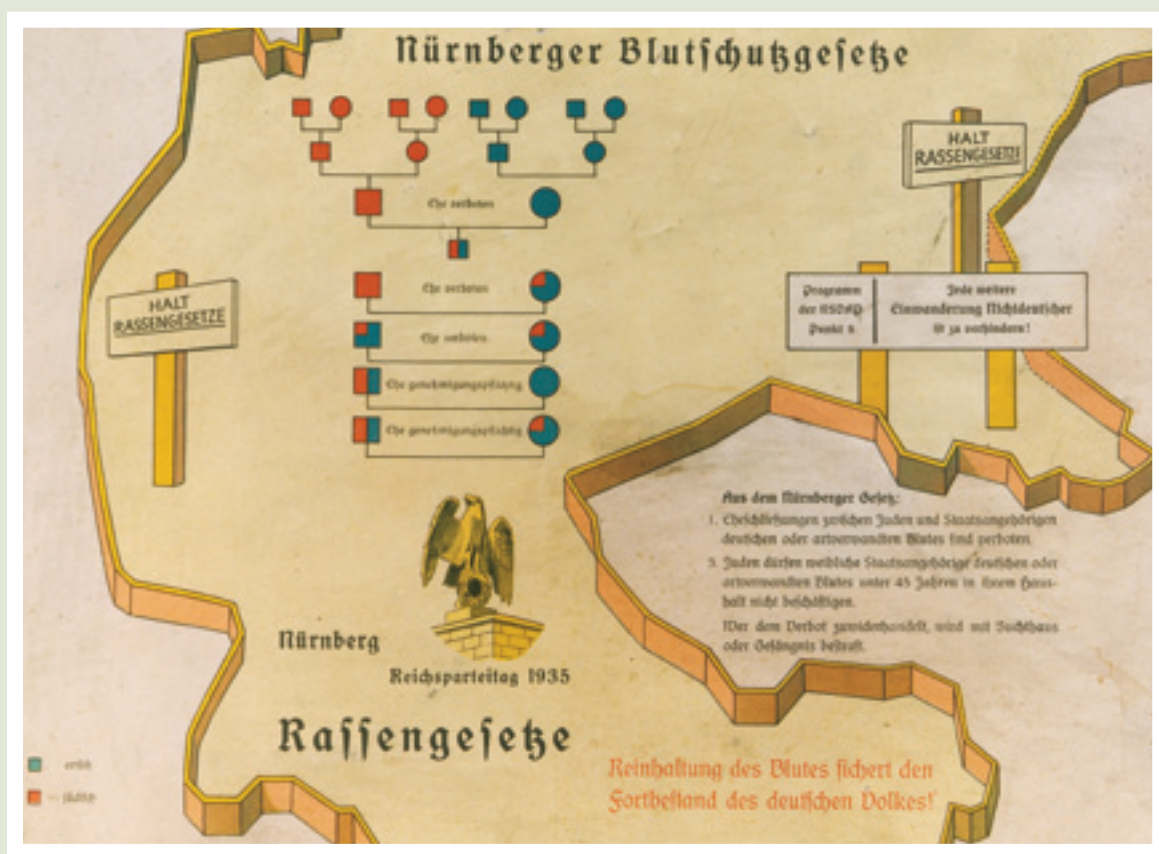
Map depicting central Germany and the degrees of forbidden marriage between Aryans and non-Aryans. Ca. 1935.