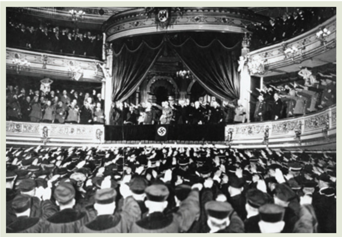
German judges take the oath of service to the Nazi state in the presence of Hitler in the State Opera House. Berlin, Germany, date uncertain.

"Constitution" with "Hitler," the oath was meant to convey that Hitler's will was the same as that of the nation and the people and that his will could not, by definition, contradict the imperative to "observe the law and conscientiously fulfill the duties" of office. In this way, the oath appeared to equate Hitler's authority with the constitution and to ensure that it would be limited by the primacy of law and duty in public office.