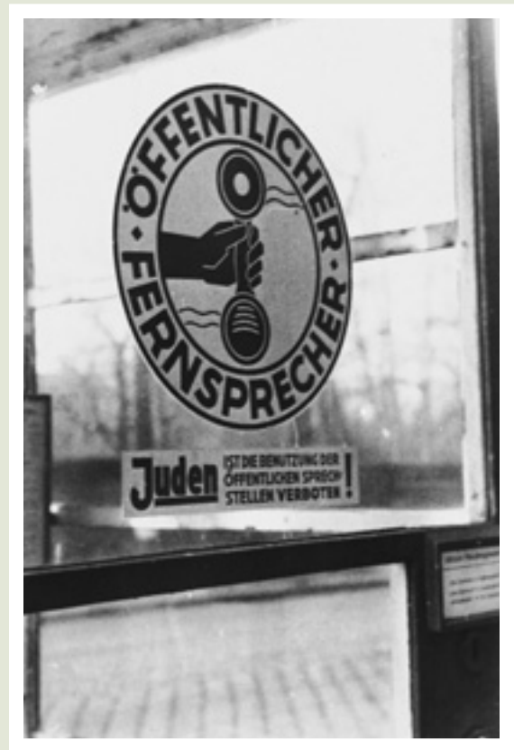
This sign, which reads “Jews are forbidden to use public phone booths,” was posted on a public telephone booth. Munich, Germany, 1942.

The President of the German Lottery forbids the sale of lottery tickets to Jews.