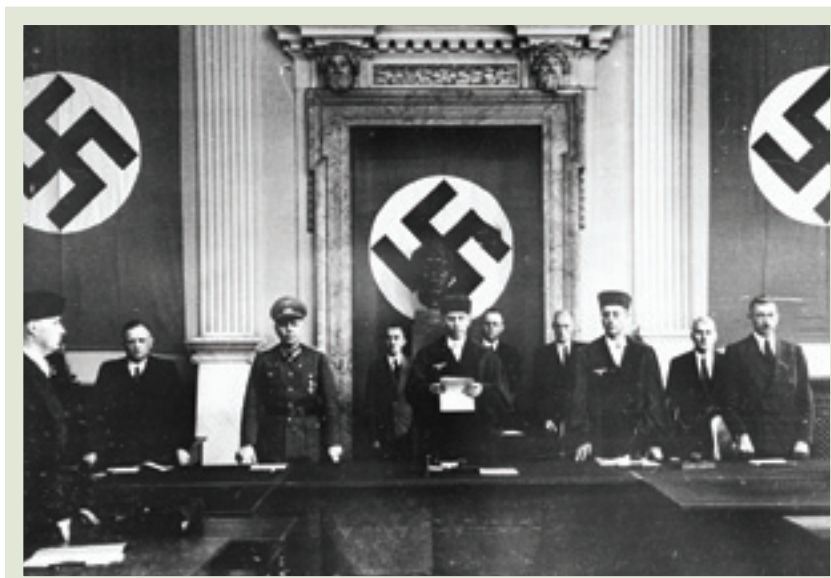
Roland Freisler, Nazi jurist and president of the People's Court, pronounces the judgment of the court. Berlin, Germany, August 1944.

Thierack's first letter addressed the use of the death penalty for persons convicted under the Decree against Public Enemies (Volksschädling-verordnung) of September 5, 1939. Under that law's terms, a person could be sentenced to death—regardless of the severity of the accusation—if he or she was found to have exploited the wartime circumstances to commit the crime in question and, additionally, if judges determined that "sound popular judgment" required them to sentence the person to death. Thierack's letter states in no uncertain terms that it was the desire and expectation of the Ministry of Justice that judges would uniformly apply the death penalty in such cases. As Thierack wrote, "Those in the administration of justice must recognize that it is their job to destroy traitors and saboteurs on the home front. [...] The home front is responsible for maintaining peace, quiet, and order as support for the war front. This heavy responsibility falls especially to German judges. Every punishment is fundamentally more important in war than in peace."