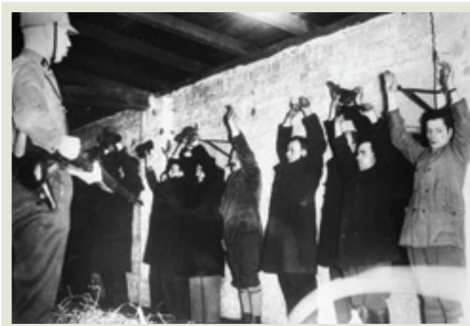
An SA man guards members of the German Communist party being held in the basement jail of SA barracks. Berlin, April 1, 1933.

The Supreme Court failed to challenge or protest the loss of judicial authority at this time. In general, it approved of the Nazi leadership's decisive action against left-wing radicals (e.g., communists) that seemed to be threatening the government's stability. Further, the Supreme Court had been the court of first instance for treason cases since the Imperial period but, by the 1930s, it was overburdened with such trials and had endured relentless criticism from all sides for the judgments it rendered. The court was ultimately relieved to have responsibility for political crimes removed from its jurisdiction.