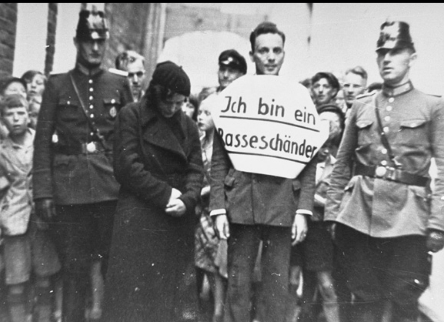
German police officers march a young man who has had illicit relations with a Jewish woman through the streets. He is wearing a sign that reads "I am a defiler of the race." Norden, Germany, July 1935.