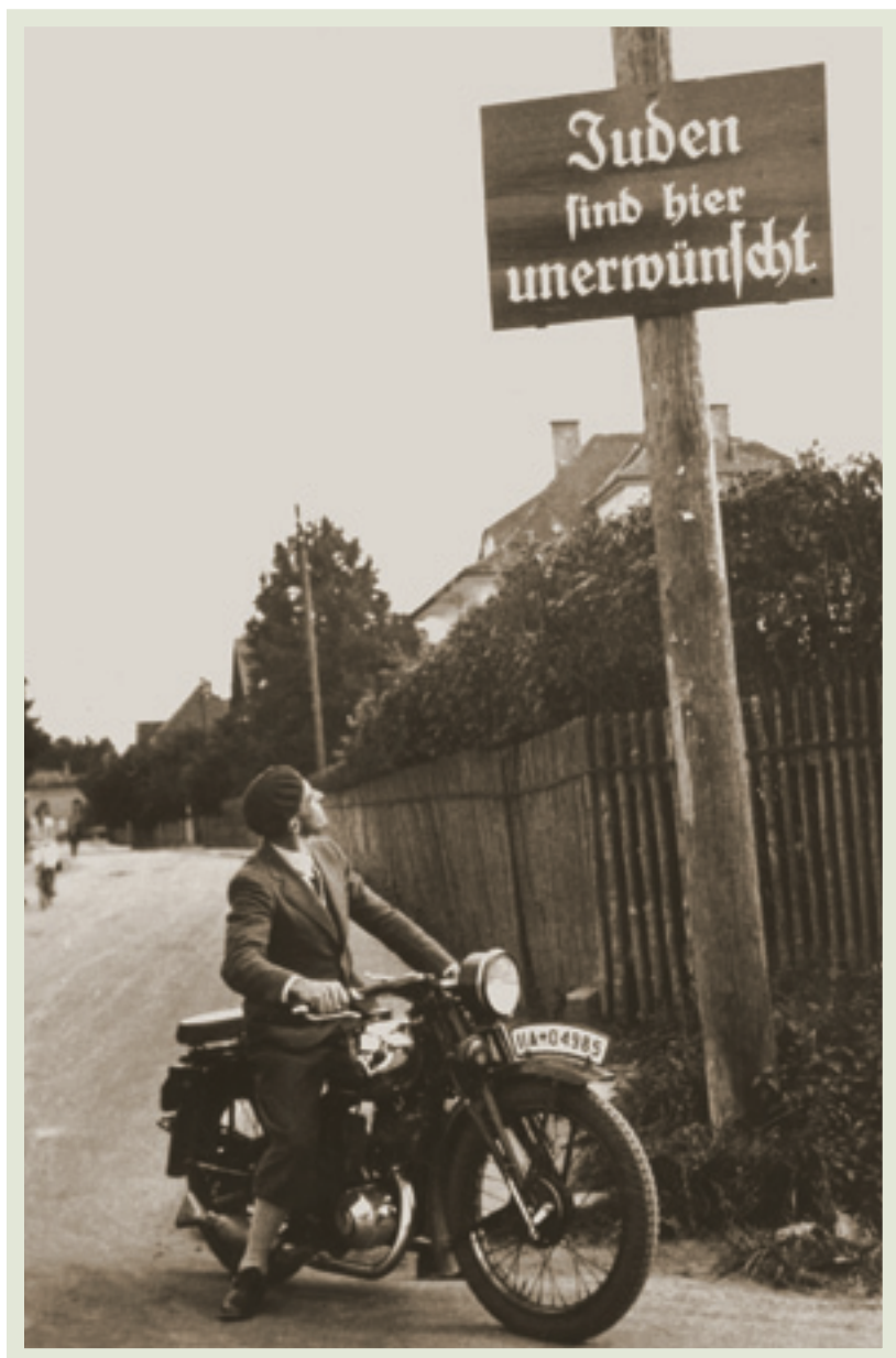
Signs like this one reading “Jews are not wanted here” were commonplace in Nazi Germany, 1935.

November 9–10, 1938, Nazi legislation barred Jews from all public schools and universities, as well as from cinemas, theaters, and sports facilities. In many cities, Jews were forbidden to enter designated “Aryan” zones. The government required Jews to identify themselves in ways that would permanently separate them from the rest of the population. As the Nazi leaders quickened preparations for their European war of conquest, the antisemitic legislation they enacted in Germany and Austria paved the way for more radical persecution of Jews.