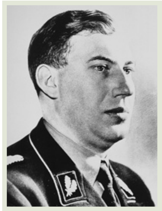
Wilhelm Stuckart, Nazi politician and State Secretary in the Ministry of the Interior, drafted the Nuremberg Race Laws in 1935.

The Nuremberg Race Laws represented a major shift from traditional antisemitism, which defined Jews by religious belief, to a conception of Jews as members of a race, defined by blood and by lineage. For this reason, the Nuremberg Race Laws did not identify a “Jew” as someone with particular religious convictions but, instead, as someone with three or four Jewish grandparents. Many Germans who had not practiced Judaism or who had not done so for years found themselves caught in the grip of Nazi terror. Even people with Jewish grandparents who had converted to Christianity could be defined as Jews.